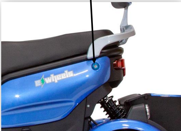
Insert Key into Rear Lock