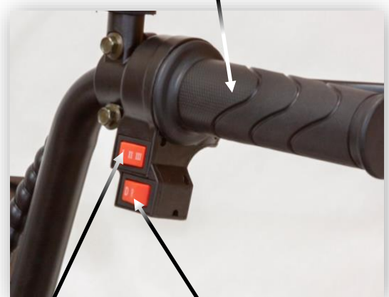
Speed Selector Switch